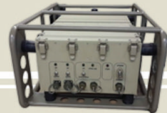
Drop Unit Customer Embedded