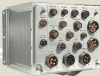
Intelligent Power Distribution Unit