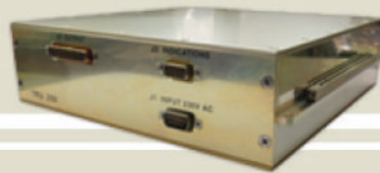
Calmark Cooling Defined Surface Conduction