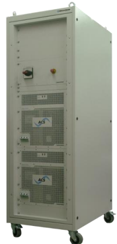
Figure 2: multitrack system made by Regatron AG